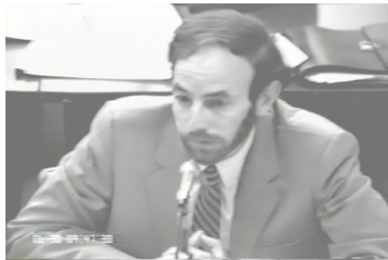
Figure 3: Presentation of spread spectrum NOI at June 30, 1981 Commission meetin