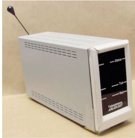
Figure 5: First commercial unlicensed spread spectrum system: Telesystems ARLAN (shown without separate power supply)

MHz wireless LAN system. The second system was made by an Atlanta area startup, Gambatte, Inc which introduced a specialized radio LAN for the MIDI data format used by musicians. It quickly became popular in the niche market for live performance equipment by top rock artists, and the basic technology is still in use in equipment designed for real time monitoring of radiation exposure of workers in nuclear power plants.